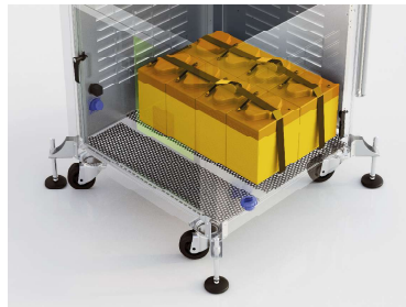
MODULAR BATTERY PACK